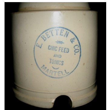
The back side of Glenn's new chicken fount. Pretty!

"If we get enough (recipes) we may put out a small cookbook..."