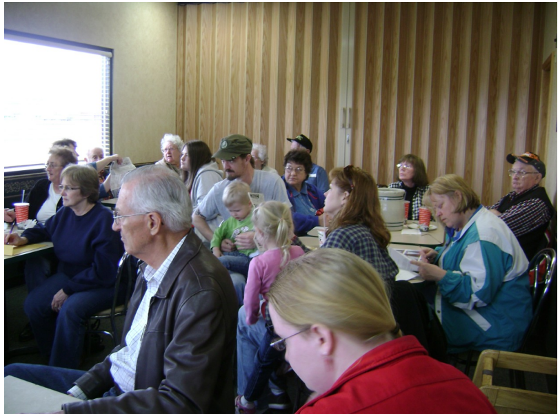
Above: A portion of the crowd at the Spring Meeting in Huron.